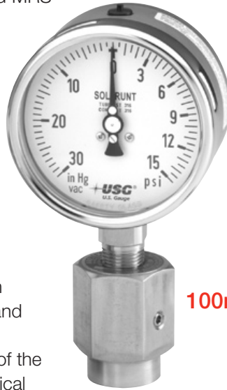
Type EW with a 100mm Model 659 Gauge

The E Series' compact design allows for installation in applications where space is limited. These seals operate with most 100mm and smaller gauges.