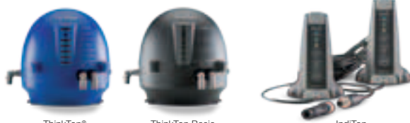
ThinkTop® ThinkTop Basic IndiTop