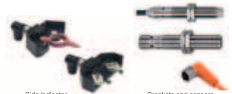
Side indicator Brackets and sensors