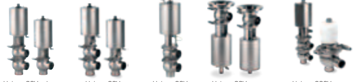
Unique SSV valve (standard configuration) Unique SSV aseptic valve Unique SSV ATEX Unique SSV tank outlet valve Unique SSSV small single-seat valve