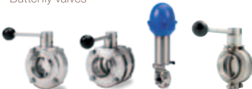
LKB with standard handle LKB-F for flange connections CBFV clamp butterfly valve SBV sanitary ball valve