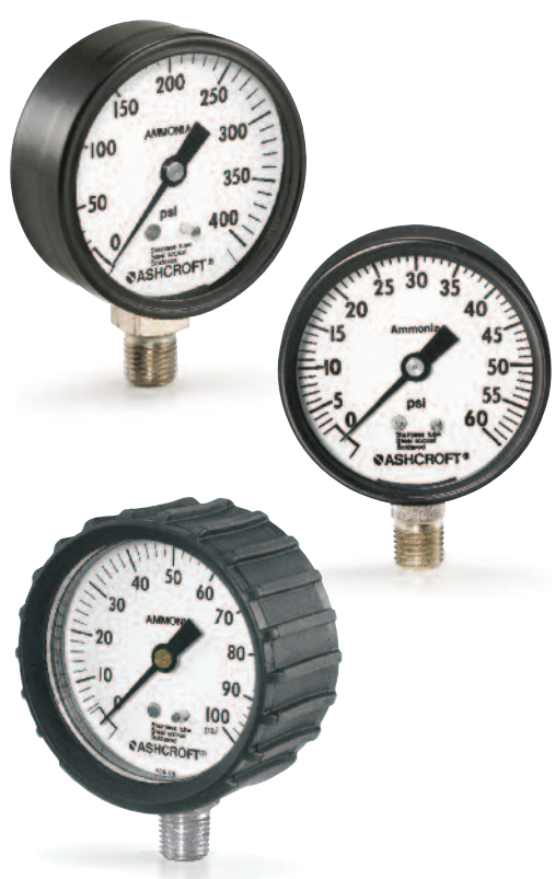
Shown with Optional Rubber Boot