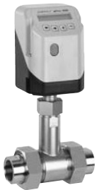
Complete measurement device 3030 ... DD ...