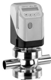
Complete measurement device 3030 ... DN ...