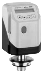
Separate measurement device 3030 ... ZU ...