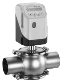
Complete measurement device 3030 ... DU ...