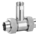
Separate fitting 3030 ... KD ...