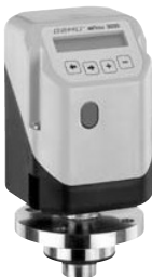
Separate measurement device 3030 ... ZN ...