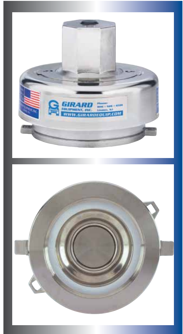
DOT 3X407T and DOT407LT

3,726 SCFH AT 6" HG (EQUIVALENT TO 584 GPM) INSTANT OPENING AT 4" HG